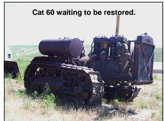
Cat 60 waiting to be restored.

Stan's latest purchase is an Allis Model K that is very clean and runs very well, all it needs is to be cleaned and painted. The