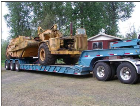
Cat DW 21 Scraper being moved to Halton Tractor in Salem.

the Museum. Although these machines are not pristine, they have collectable value.