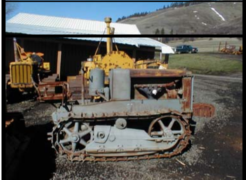
Cat 2 Ton runs, needs cleaned and painted $4,950