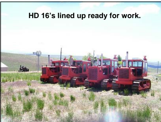
HD 16's lined up ready for work.

He has a Cat 60, Cat 30 several Cle-trac's that are all on his agenda to restore since he is interested in all makes of crawlers from the McCormick 40 which he