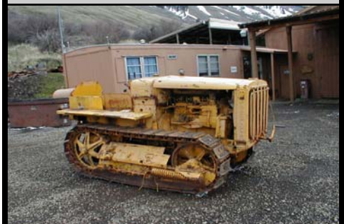
Cat 22 complete, engine free $2,250

Used parts for Caterpillar tractors Cat 2 Ton, 10,15, 20, 22, 28, 30, 60, D2 and D4 tractors. Used dozers, starting engines, main engines undercarriage parts. Antique tractors for sale. Wanted antique Cat crawlers for parts or complete machines.