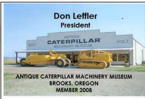
A sample of ACMM's 2008 membership card for new and renewing members.